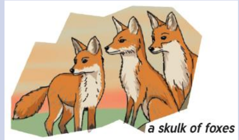
a skulk of foxes